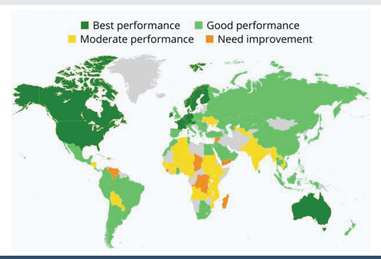
Figure 3: Food security status. Source: [17].

the negative effects of COVID-19 on jobs and livelihoods. In developing countries, social safety nets are not well developed and Covid-19 can lead to absolute poverty and hunger [21]. In response to the Covid-19 disruption, the World Food Program should double the assistance to the people in acute food insecurity.