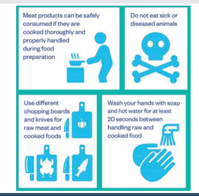
Figure 4: COVID-19 practice for food safety Source: [3]

in identifying the most vulnerable groups in the society and allocating necessary food and financial aid to help them survive throughout the pandemic period. Immediate demand for the food industry to make sure compliance with measures to protect food handlers not to transmitting the virus, avoid exposure to or transmission of the virus, and enhance the status of food hygiene and sanitation. The stakeholders in food processing plants and businesses should abide by good hygienic practices and good manufacturing practices guidelines established by codex Alimentarius commission to deliver safe and quality products to the consumers.