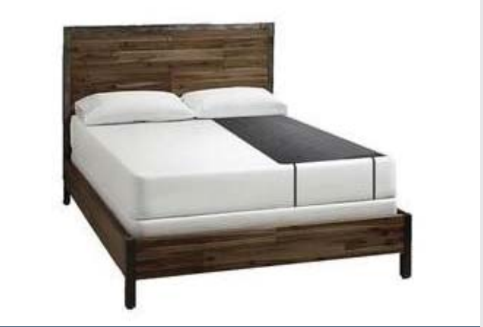
Figure 2: Grounded sleep system consisting of a conductive carbon pad connected to an electrical earth ground.