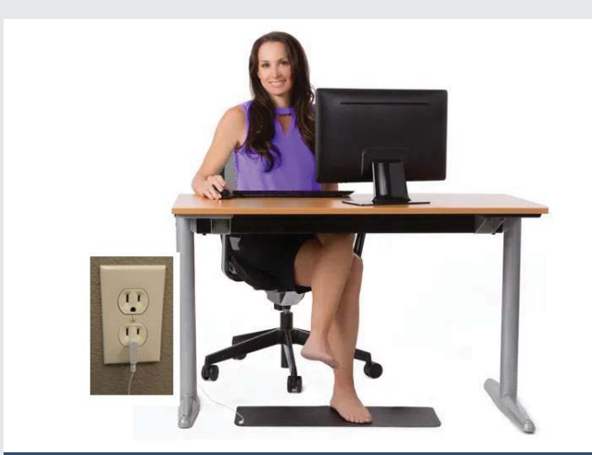
Figure 3: Working at the computer with bare feet on a grounding pad connected to an electrical ground.