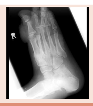
Figure 4: X-ray Right foot: Soft tissue masses in the 1st & 2nd intradigital space, beginning osteomyelitis 2nd metatarsal right.