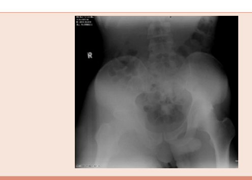
Figure 3: X-ray Pelvis: Consider arthritic hip, probably infectious in origin.

On dermatological examination, he was found to have multiple, ill-defined, soft to firm, confluent erythematous nodules productive of seropurulent discharge associated with tenderness and swelling over the anterior right thigh and right foot (Figures 5-7).