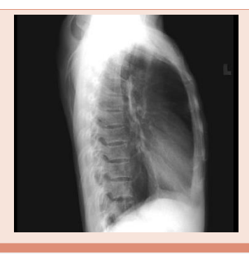
Figure 2: Chest X-ray Lateral view: Pulmonary Tuberculosis right upper lobe, Pleurodiaphragmatic adhesion bilateral.