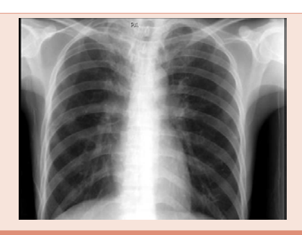
Figure 1: Chest X-ray PA view: Pleural effusion vs pleural thickening right.

His Chest X-ray PA and Lateral view revealed pleural effusion vs. pleural thickening right, PTB R. upper lobe, pleurodiaphragmatic