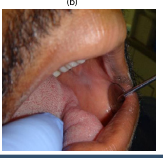
Figure 4a,b: Post-treatment clinical appearance, notice complete resolution of lesions.