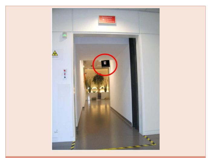
Figure 3: View into the treatment room: A monitor is positioned in the entrance area (red circle), showing a portrait photo and the name of the patient, actually loaded in the treatment control computer.