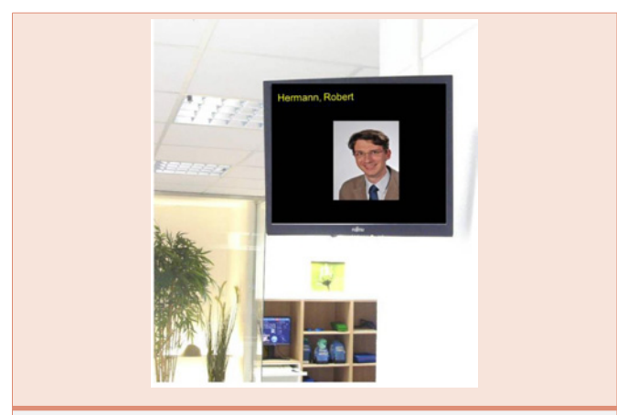
Figure 4: Display screen: The patient himself and the staff pay attention that the name and the portrait of the patient are shown on the monitor. So the patient is actively involved in risk management and quality assurance.

This identification-portrait together with the surname is shown on the monitor (Figure 4). Each patient is adviced to look at the monitor while entering the treatment room on his way to the LINAC, and – together with the staff – to make sure that his name and his portrait are shown. So the patient himself confirms his identity – independently of the staff. This is a very simple but effective tool to crosscheck the patient with the uploaded treatment plan in the treatment control computer.