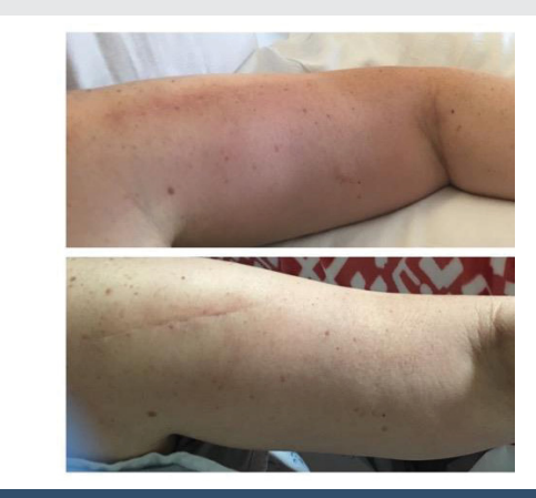
Figure 1: A. Baseline presentation of erythema and edema, B. 48 hours after treatment with steroids.

Two months after the initial presentation she was hospitalized for severe pain in the area of the intramedullary