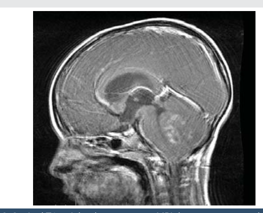
Figure 2: Sagittal T1 weighted post contrast MRI demonstrates an enhancing mass in the posterior fossa, likely arising from the vermis and extending into the fourth ventricle.