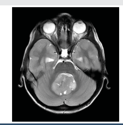
Figure 1: Axial T2 weighted MRI demonstrates a low signal predominantly solid mass in the midline, involving the fourth ventricle.

Priyanka Meesa, Undergraduate student at Duke University Akash Meesa, Undergraduate student at Duke University