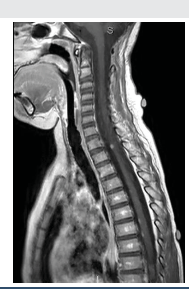
Figure 4: Sagittal T1 weighted post contrast MRI of the spine demonstrates leptomeningeal enhancement consistent with metastatic disease.

Figure 3: The mass demonstrates restricted diffusion on DWI sequences.