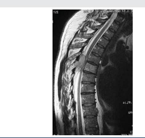
Figure 1: MRI T2 sagittal image

This is a retrospective study where 124 patients from January 1st, 2000 to May 31st, 2015, affected by multiple myeloma with vertebral localisation were included. All the patients were operated at a single centre by senior surgeons belonging to a single unit. Demographic details like age, sex were noted. All patients, before the surgery, were studied with standard X-ray, bone scan, CT and MRI (Figures 1,2) of the spine and location, number, type of lesions were noted. Laboratory tests including serum immunoelectrophoresis and the Bence-Jones protein urine/blood test were also done. They were clinically assessed prior to surgery and patients were divided into those presenting with only pain, radicular symptoms and neurological deficit. Visual Analogue Scale (VAS) was used and the scores were categorised into mild, moderate and severe. Written and informed consents were taken regarding the surgical procedure they underwent. Intra and post operative complications, if any, were noted.