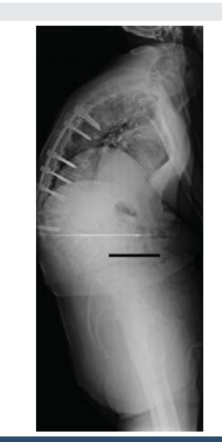
Figure 3: rx sagittal post.

a haematoma underwent to surgical revision with evacuation of the haematoma. All 4 patients improved in function at 1 year follow up.