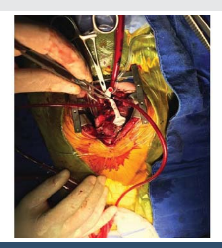
Figure 2: Prostetic shunt