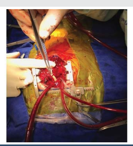
Figure 1: Prostetic material.

The impact of each intervention on the anatomical structures mentioned, as well as on systolic and diastolic right ventricular function, should be considered in detail in order to obtain adequate results. (Figure 4) Types of palliation.