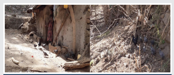
Figure 3: Hatched Koekoek off springs using the local hen (Ms. Alemayo Yehalay), Serako Kebelle, 2019.

egg and meat production under scavenging condition with little supplementation as compared to other improved breeds. By giving strong emphasis on the management aspects like housing, watering, feeding and vaccination; the breeds are promising to the area to enhance the meat and egg production of the poultry. Therefore, the breeds have to be scaled to large farmers of the area.