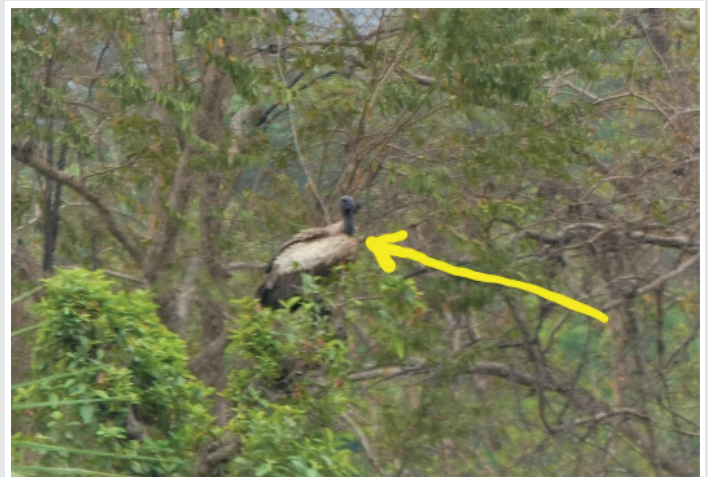
Figure 3: Picture of Gyps Africanus sighted in Gashaka Gumti National Park, Nigeria.

The outlook of the study conducted on the Animal Health Workers (AHWs) perception of the impact of NSAIDs on vultures is evident that this category of stakeholders is largely unaware of what is perhaps one of the most significant topical