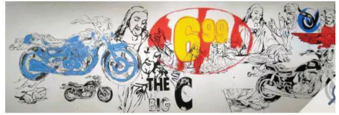
Figure 4: The Last Supper (The Big C) by Andy Warhol.

column capitals framing the space, is a reminiscent of history and legacy of the Roman architecture. The purpose here is to metaphorically create a cool watery blue effect that resonates with the function of the building.