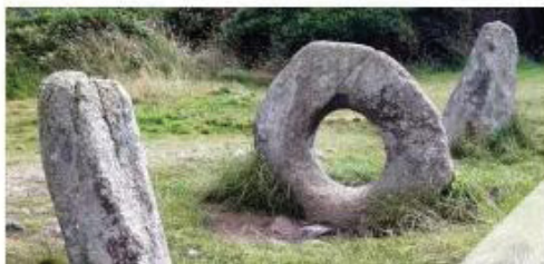
Figure 3: Men-an-Tol Megalith by Madron, UK.

Another example is that of the Water Treatment Works Building designed by Terry Ferrell. “The interior of the building serves as an excellent example of post-modern architecture inspired by Roman classicism” (IAD 600: Concept, Theory and the Design Process) [14]. Here, the barrel-vaulted ceiling and the rhythmic rings of light above the two apparently Roman