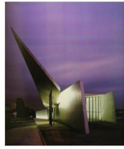
Figures 5,6: 911 Finestra Chair (Michael Graves) and Vitra Fire Station (Zaha Hadid, 1993).