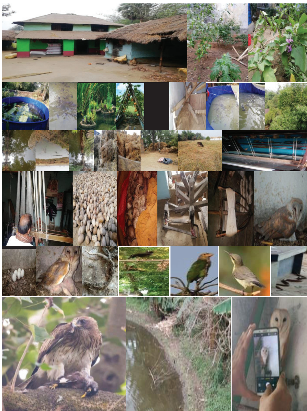
Plate 1a: Rural Area .

sizes of comfortable artificial permanent concrete or temporary wooden nests, as per availability, in the building as well as in the trees for the several types of bird, mongoose and squirrels, rainwater-harvesting with fishery for pisciculture, and floating or rooftop gardening for food, or nutritional kitchen garden for nutritious fruits and vegetables, forming the common-complex-ecosystem (Plate 1), with landscaping by trees, garden, midday-meals, store-grains reservoir's, playground, pond, and river with agriculture, where exhibited an enriched faunal diversity attracting or comprising small mammals, birds, reptiles, toads and insects etc., and some examples are mynah, dove, magpie, drongo, oriole, bulbul, crow, cuckoo, babbler, kingfisher, woodpecker, migratory birds, squirrel, bats, tailor birds, snake, mongoose, mice, frogs, cats, stray dogs, different