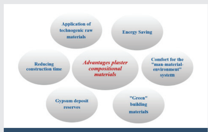
Figure 2: Prerequisites for the use of gypsum composite materials.

A rational relationship was established between Portland cement and finely dispersed quartz sand, in which the hardening process of CGB will take place without dangerous internal stresses leading to volumetric deformations and the