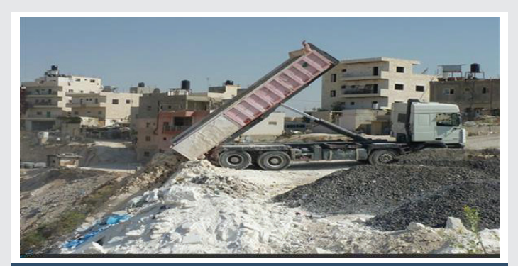
Figure 1: Stone crushing waste near residential buildings

strategy is being developed to support this industry sector. The stone of Palestine is almost the only natural resource in use that is exported abroad. Thus, in Palestine, the stoneworking industry is the mainstay of the national economy.