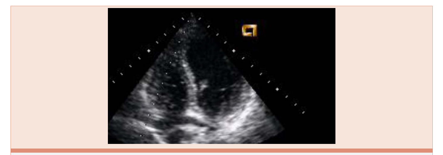
Figure 1: Transthoracic echocardiogram: Appearance of micro bubbles in the left atrium after 6 beats from opacification with shunt extra cardiac. Mention the title and explanation of figure.

POPH is defined as pulmonary hypertension associated with portal hypertension whether or not portal hypertension is secondary to hepatic disease. Diagnosis is based on the pressure obtained by a RHC with MPAP > 25mmHg, pulmonary arterial occlusion pressure