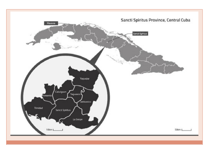
Figure 1: Map of Cuba showing the location of the Sancti Spiritus Province and its corresponding municipalities. (see attached).

Only patients with definitive clinical diagnoses were included in the study. Clinical diagnosis of acquired OT was defined by the presence of classic active focal retinochoroidal inflammation without associated retinochoroidal scars in either eye as well as a response to therapy as expected. Furthermore, these patients had no history of prior documented episodes or symptoms suggestive of prior episodes. A diagnosis of congenital OT was made based on multiple factors including: the presence of quiescent retinal toxoplasmic scars before the age of seven years, complications, and retinochoroidal lesions in the mother. Because of the presence of old scars in some patients, the exact time of onset of ocular disease who could not be determined and these patients were classified as undetermined.