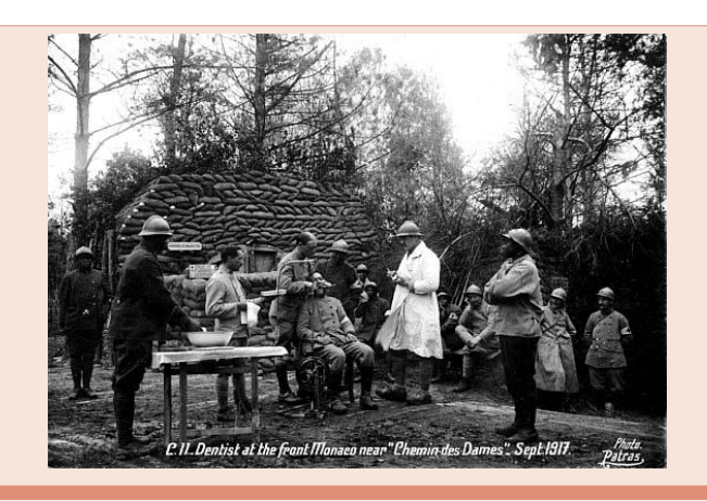
Figure 3: A dentist on the front near the « « Chemin des Dames » - September 1917 [4].