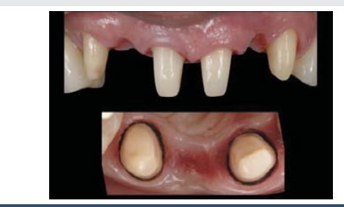
Figure 3: A well-polished and clear tooth preparation facilitates the margin visibility and delimitation, contributing to a better contour for future restoration.