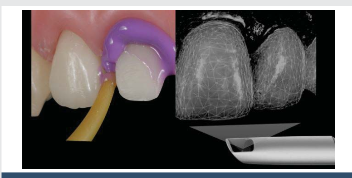
Figure 1: Different methods but same biological principles.

impressions with elastomers materials compared to lightoptical acquisition represents a totally different domain in terms of the method to acquire this information. However, the intra-oral matter remains the same and yet the biological components (hard tissues – tooth and bone and soft tissues – gingiva, tongue, cheek, lips) play a role under equal principles.