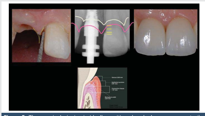
Figure 5: The marginal gingiva is ideally positioned and when one respects the biological width and the gingival biotype, it can create a proper tissue response without inflammation, avoiding the likelihood of bleeding during tissue manipulation.

by perfectly adapting to the material without any inflammation or invasion of biological width [10,15-17] (Figure 5).