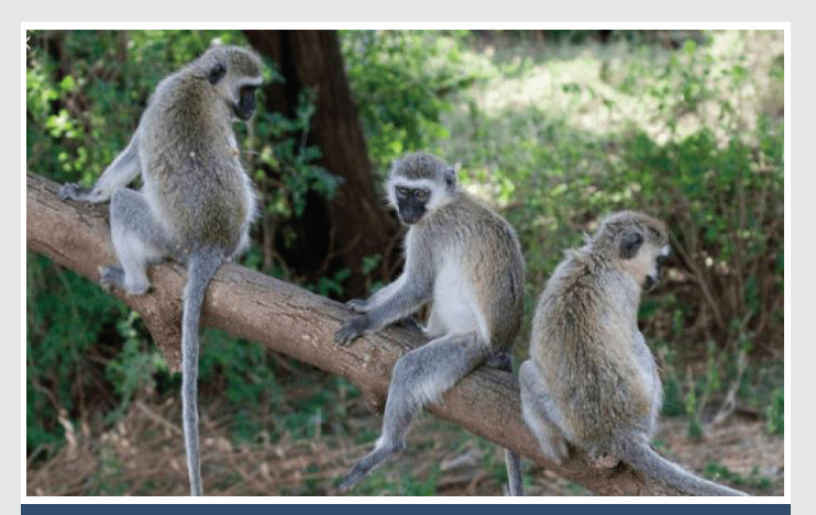
Figure 2: Monkeys in agricultural lands: Source /KNA [14].

of sandy, loamy soils and patches of black cotton soils, stony and rocky soils, and hilly terrain with busy Acacia / Commiphora vegetation and sparse human population on the lowlands and hills sides of the habitats [5]. Further, it has riverine vegetation along the seasonal Tiva and Mwitasyano rivers that transverses on the eastern and western sides of Kwa Vonza/Yatta ward respectively. This forms a suitable habitat for wild animals, like snakes, monkeys, guinea fowls, dik-diks, etc. These wild animals are bound to destroy crops, attack livestock, injure humans and create fear among the residents of Kwa Vonza/ Yatta ward in Kitui Rural Constituency.