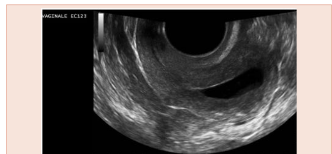
Figure 3: Transvaginal ultrasound 40 th days after the start of the therapy: fluidization of the caseous material.