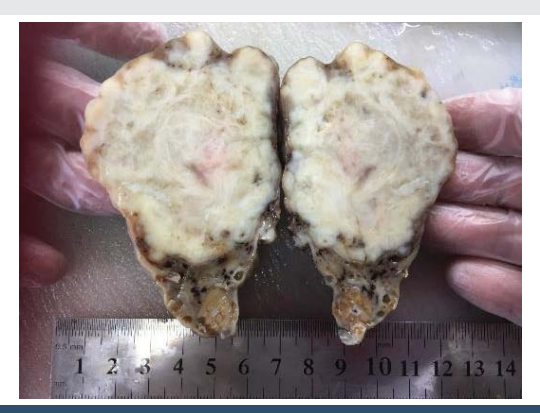
Figure 1: A rare presentation of an ovarian leiomyoma in a 41 year old asymptomatic pregnant woman. The tumor size was 7 cm in diamater.

In the present study, it was determined that in nearly half of the ovarian surgeries carried out for reasons that are not malignant, these surgeries were carried out because of functional and temporary ovarian lesions, followed by