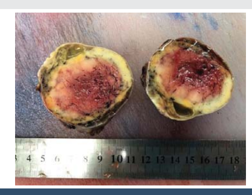
Figure 3 : 56 year old female with an ovarian mass (5,7 cm in diameter), diagnosed as Granulosa cell tumor.

epithelial ovarian neoplasms, which are from neoplastic ovarian pathologies. In this study, it was concluded that in approximately half of the ovarian surgeries that were carried out because of pathology that was not malignant, there was in fact ovarian pathologies that were benign and that were not neoplastic. Based on this outcome, we believe that unless an additional indication like urgent intervention (i.e. adnexal torsion, etc.) or abscess drainage is involved, it may be more accurate to avoid surgery in such pathologies.