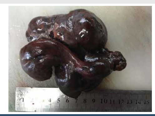
Figure 2: Adnexal torsion in children is a rare condition. The salpingo-oophorectomy material is from a 12 year old girl. Histopathologic examination showed ischemic persons.