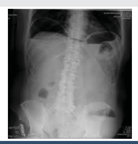
Figure 1: Crescentic gas shadow under right dome of diaphragm.

She was seen in outpatient clinic one-month post operatively and he was symptoms free. She had put back most of her weight.