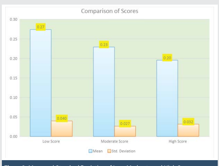
Figure 1: Mean and Standard Deviation of Low, Moderate and High Scores

The study was carried out to determine the effect of Smartphone Addiction on Reaction Time in Geriatric Population. The result of the present study showed that the RT of the High Score group is comparatively less than the low and moderate