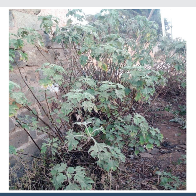
Figure 1: Tithonia diversifolia aerial parts.

diarrhea, wound healing among others, the effects of this drug are said to be attributed to the presence of terpenoids and flavonoids in its aerial parts. With the exploration and incorporation on the scientific understanding of plants, there has been the need to collect information on various kinds of plants that can be used in treatment of various specific ailments [3].