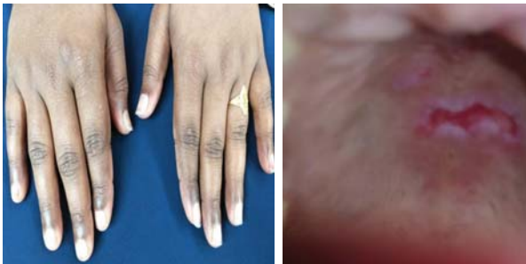
Figure 1&2: Showing symmetrical arthritis involving MCP and PIP of both hands. Picture 2 showing an erythematous ulcer with irregular margin over hard palate.

At the same time she also developed erythematous, raised, painful, non-pruritic photosensitive rashes all over her face sparing the nasolabial folds (pictures 3,4). But there were no bullous lesions or no crusts.