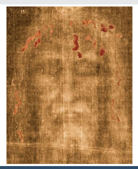
Figure 2: Jesus' face from the TS.

The morphological characteristics of the TS Man (Figure 2) and the many bloodstains present on the TS testify the hard tortures imposed on Jesus and confirm the sufferings described by the Gospels with the addition of many details, for example: fracture of the nasal septum (by beating?); more than 370 wounds by scourging [3]; cuts and bruises on his shoulders more clear on the outer side of the right suprascapular region