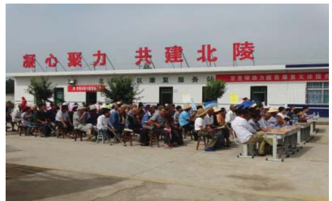
Figure 2: Courtyard outside Station.