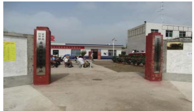
Figure 1: Entry to the Rehabilitation Service Station.

Since its establishment in March 2017, the Station consists of a single storey complex of 300 sq meters, facing an open space of 1500 sq meters. Basic equipments for physical training are available inside the complex (Figures 1-3). The environmental set up is carefully completed and selection of rehabilitation facilities are acquired with full considerations of