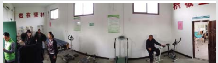
Figure 3: Inside of Service Station with simple equipments.

safety. Rural people in the vicinity are welcome to pay regular visits and use the facilities in the day time. Registered visitors will get instructions from local qualified Orthopaedic Surgeons / Rehab Workers / Traditional Chinese Medicine doctors when they come for special guidance. The instructors come from one County Hospital twice a week.