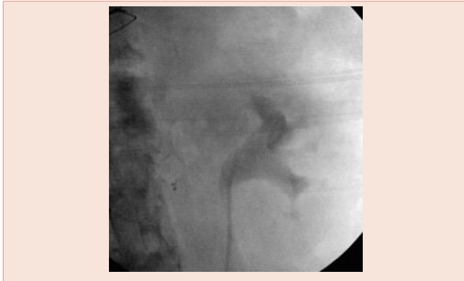
Figure 2: Retrograde pyelogram post JJ stent placement.

flow oxygen, fluids, and noradrenaline. Intravenous paracetamol was given, a target-controlled infusion of remifentanyl was initiated, and the procedure commenced. The patient was comfortable throughout, with minimal cardiovascular instability due to instrumentation of the urological tract. Resuscitation continued throughout the procedure with adjustments made to achieve optimal oxygen delivery to the tissues. Mixed venous saturations achieved a maximum of 64.9%. The procedure finished promptly within 10 minutes.