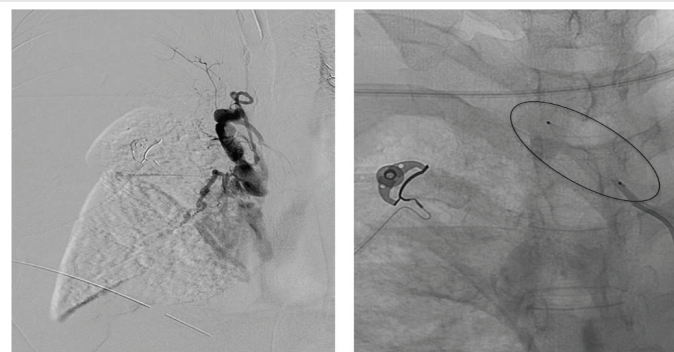
Figure 2: Outflow of contrast through a bronchial artery aneurysm (left). After setting 8mm Amplatzer® vascular plug the artery is completely embolized (right).

Spontaneous hemomediastinum is rare, and has been related with bleeding disorders, mediastinal organ hemorrhages and spontaneous idiopathic hemomediastinum. However it has not been fully described as a complication of EDS-IV. BAA as a source of massive mediastinal bleeding has been described within inflammatory disorders, infectious diseases or as a result of thoracic trauma. In our case its origin was the anomalous vascular histology associated to EDS-IV. Intrapulmonary