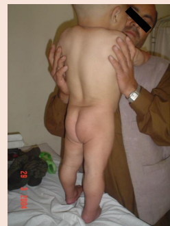
Figure 2: Child at presentation: Note the hypertrophied calf, back, gluteal and quadriceps muscles, giving the child a 'prize-fighter appearance'.