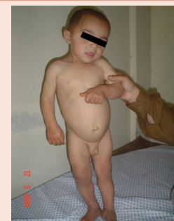
Figure 4: Child after 1½ months of Thyroxine replacement therapy showing increase in height and regression of muscle pseudohypertrophy.