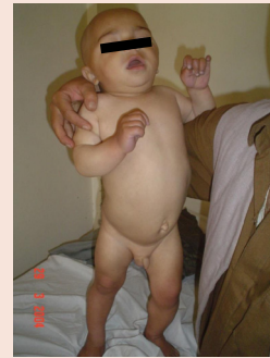
Figure 1: Child at presentation: Note the infantile upper to lower segment ratio, protuberant abdomen and small umbilical hernia.

Congenital hypothyroidism is one of the most common and treatable causes of mental retardation in children. Its incidence, detected by neonatal screening, is rather constant worldwide and is reported to be 1:3,000 to 1:4,000. In nearly 85% of cases, congenital hypothyroidism is associated with, and presumably is a consequence of thyroid dysgenesis [3]. In these cases, there might be thyroid agenesis, hypoplasia or ectopic location. When thyroid hormone therapy is not initiated within the first 2 months of life, congenital hypothyroidism can cause severe neurological, mental, and motor damage. Untreated congenital hypothyroidism virtually affects all systems producing a myriad of clinical findings. KDS syndrome, first described by Emil Theodore Kocher in 1892 and later by Robert Debre and George Semelaigne in 1934 probably results from the effects of long-standing untreated moderate to severe congenital hypothyroidism on muscles. The occurrence of this syndrome in various forms of hypothyroidism, athyreosis, ectopic thyroid as well as hypothyroidism due to dysmorphogenesis supports this possibility. In our case ectopic sublingual thyroid gland leading to thyroid dysgenesis was responsible for the congenital hypothyroidism.